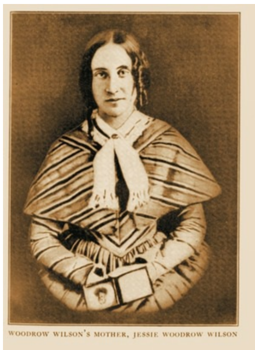
Woodrow Wilson's mother Jessie Woodrow Wilson