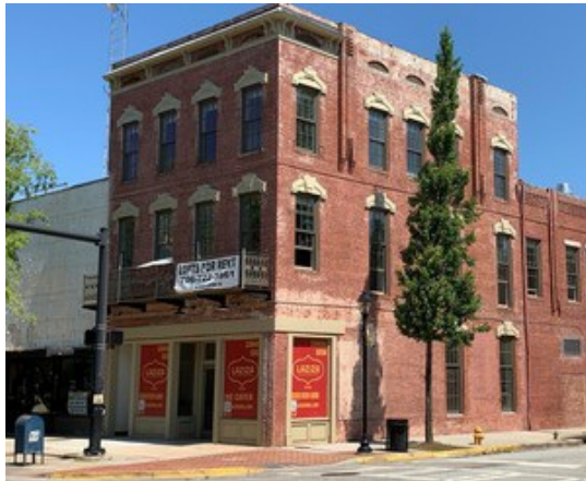
Marshall House, 901-903 Broad Street

Wison of Sherman and Hemstreet formed an LLC to purchase the building in 2020. Plans are being made to rehab the Sunday School building at the rear as offices, and restore the exterior. The sanctuary space will be rehabbed at a later time. The owners are applying for certified rehabilitation status for both state and federal historic preservation tax incentives. Work is expected to begin soon.