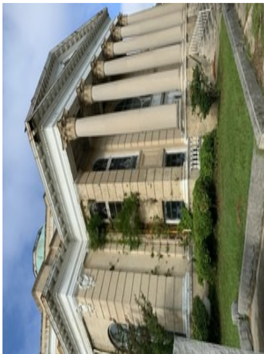
Old First Baptist Church, 802 Greene Street