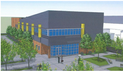
Original proposal for new IT building

The two-story 20,000 square foot IT Building will be constructed on the east side of the present Municipal Building, near Greene Street, and will be a modern building with traditional characteristics. Its brick and metal surfaces will compliment the existing architecture that surrounds it, while providing all the needs of Augusta's important 21st Century IT Department.