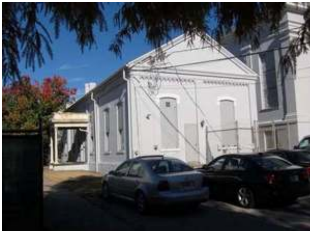
Saved!! 527 Telfair Street, Antebellum Court House Annex

Historic Augusta, Inc. is pleased to announce that during the meeting of the Augusta Historic Preservation Commission on Thursday, December 19, 2013 an architectural design for a new Information Technology Building (IT Building) was presented and approved that is in keeping with the guidelines of the Downtown Augusta Historic District. At the same time, the last remaining 19th Century court building on the block will also be preserved. Plans were approved after two months of discussions and negotiations between city officials, Virgo Gambill Architects, the project designers, members of the Augusta Historic Preservation Commission and representatives of Historic Augusta, Inc.