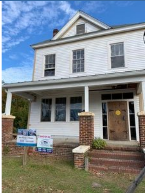
Rev. C. T. Walker House, 1011 Laney-Walker Boulevard

Dedication of New Historical Marker for Rev. C. T. Walker Wednesday February 5 at 10:30am