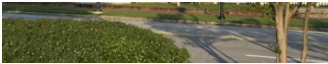
Boyhood Home of President Woodrow Wilson