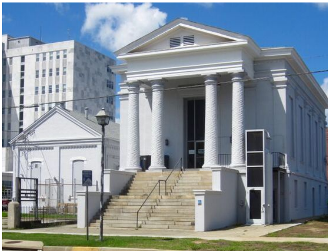
The Augusta Jewish Museum at 525 Telfair Street.