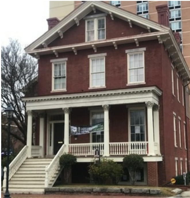
Joseph Lamar House