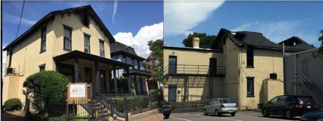
Richard B. Morris House, 611 Telfair Street, Augusta Downtown Historic District

Recent severe weather has impacted two of Augusta's historic neighborhoods. On Sunday June 24th, lightning struck the Richard B. Morris House, 611 Telfair Street , causing significant fire damage to the attic and extensive water damage throughout the building.