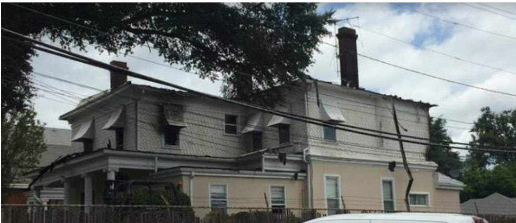
Rectory, St. Mary's on the Hill Catholic Church, Summerville Historic District