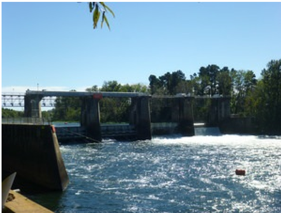
New Savannah Bluff Lock and Dam, listed on the 2018 Endangered Properties List

During the summer, Historic Augusta is accepting nominations for two of its annual programs; the 2020 Endangered Properties List and the 2019 Preservation Awards.