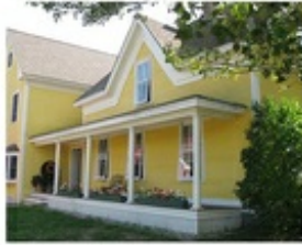
Farmhouse with energy efficient storm windows.

The concept of energy conservation in buildings is not new. Throughout history building owners have dealt with changing fuel supplies and the need for efficient use of these fuels. Some are the days of the cheap and abundant energy of the 1950's. Today with energy resources being depleted and the concern over the effect of greenhouse gases on climate change, owners of historic buildings are seeking ways to make their buildings more energy efficient. These concerns are key components of sustainability—a term that generally refers to the ability to maintain the environmental, social, and economic needs for human existence. The topic of sustainable or "green" building practices is too broad to cover in this brief. Rather, this preservation brief is intended to help property owners, preservation professionals, and stewards of historic buildings make informed decisions when considering energy efficiency improvements to historic buildings.