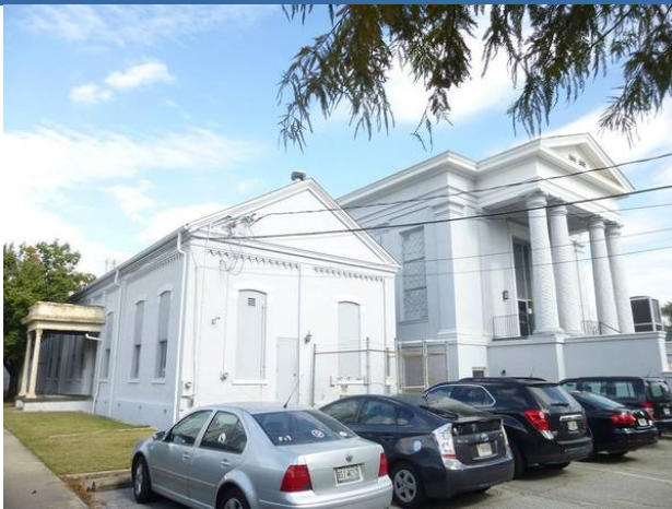
The Court of Ordinary, built c. 1860, on the left and the Children of Israel Synagogue, built 1869, on the right.

Historic Augusta staff, board members, and concerned citizens have attended several Public Services Committee and Augusta-Richmond County Commission meetings to show solidarity in saving these two significant and irreplaceable 19th Century historic resources.