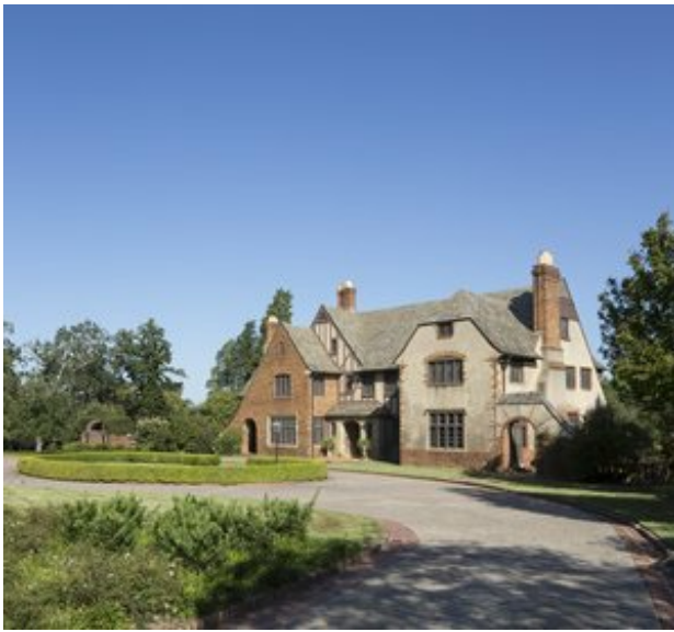
Salubrity Hall, 2259 Cumming Road