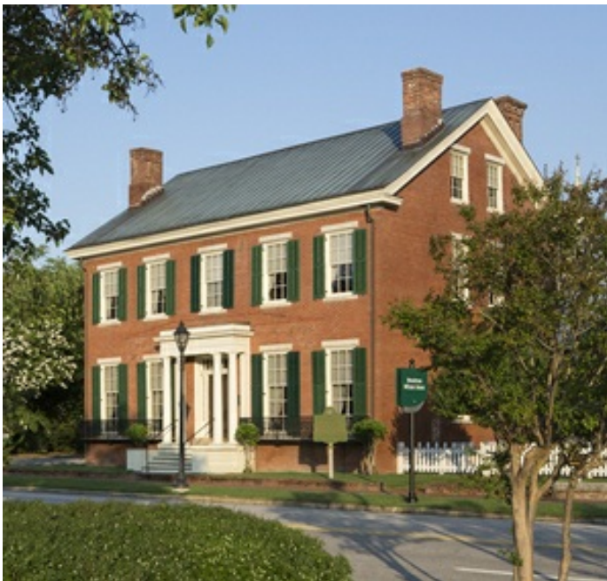
The Boyhood Home of President Woodrow Wilson

Each year historic preservation is recognized during the month of May. Initially, National Preservation Week began to promote preservation awareness in 1973. In 2005, the National Trust extended the celebration to the entire month of May. It is an opportunity to focus on the diverse and unique heritage of our entire country's cities and states. The National Trust is featuring one building each day of the month. You may visit their website and enjoy what they have to share at nationaltrust.org .