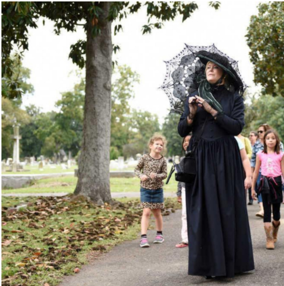
Westover Memorial Park is located at 2601 Wheeler Road, Augusta

Join us for Walk with the Spirits October 26 and 27, 2019 in Westover Memorial Park