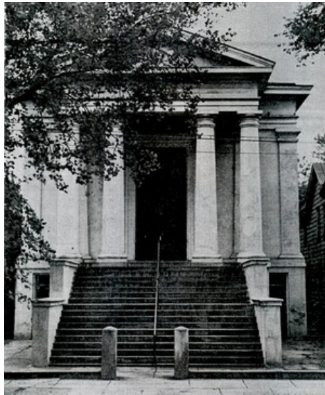
Temple circa 1950

significant structures and sites in Augusta and Richmond County, Georgia. We serve as an advocate for those with preservation interests. When an historic building is threatened with demolition, we intercede to try and prevent the loss of irreplaceable history. Historic Augusta also encourages the preservation of historic buildings by other groups and individuals and works to help them accomplish their goals.