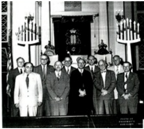
Interior of Temple circa 1950

The original Telfair Street Temple, built in 1869, is the oldest standing synagogue structure in Georgia. Many congregants came from nearby Hamburg, SC, and Aiken, SC, as well as the Augusta area. The Greek Revival style building was a place of worship until 1950 when it was converted into offices. The Court of Ordinary was constructed by Richmond County in 1860 to house irreplaceable wills, deeds, marriage licenses, and other court records. Built as a "fire proof" building, it was designed in a time when many courthouse fires destroyed invaluable records throughout the nation.