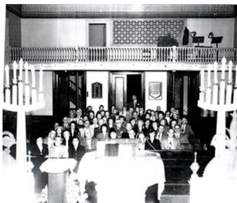
Interior of Temple circa 1950

Following restoration, both buildings will become a regional center of learning and awareness with exhibits and programming chronicling the life, history, and contributions of the Jewish community in the Central Savannah River Area as well as educate about the horrors of the Holocaust.