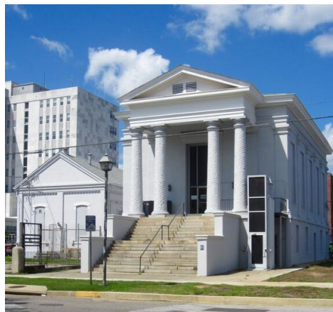
Court of Ordinary and Temple