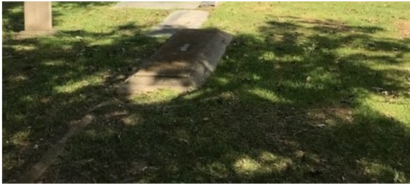
Fitten Street Cemetery