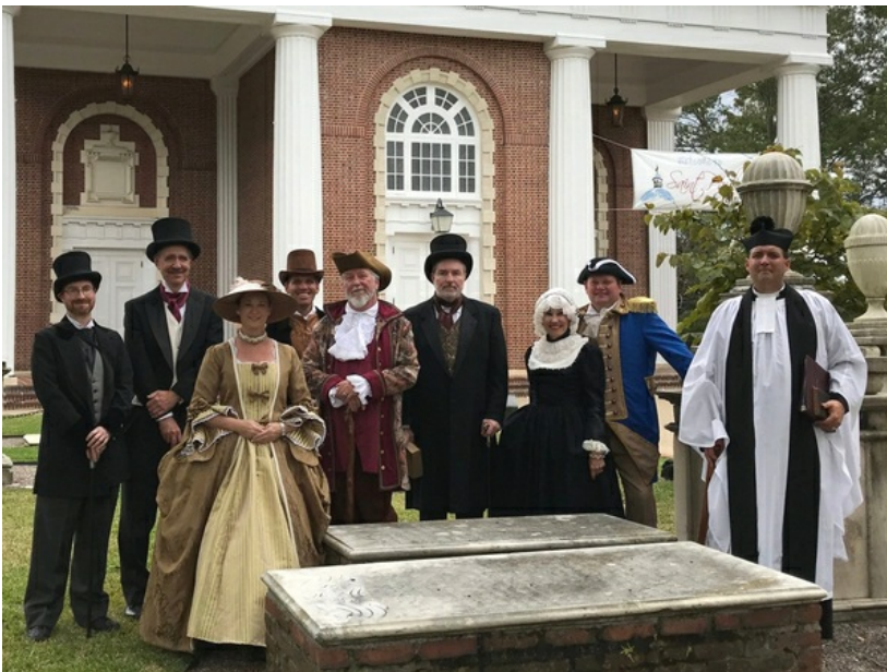
The cast of Walk with the Spirits 2017

Historic Augusta's annual cemetery tour, Walk with the Spirits, returns this weekend! Reserve your spot at this family-friendly event, and "Walk with the Spirits"